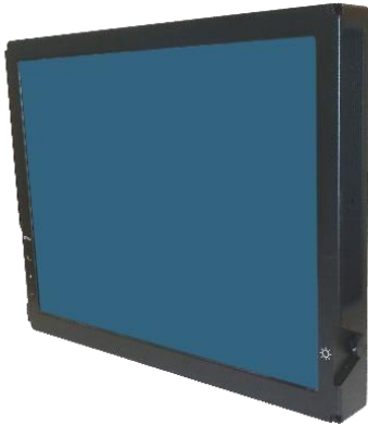
Typical ARD17 Rugged 17" Display