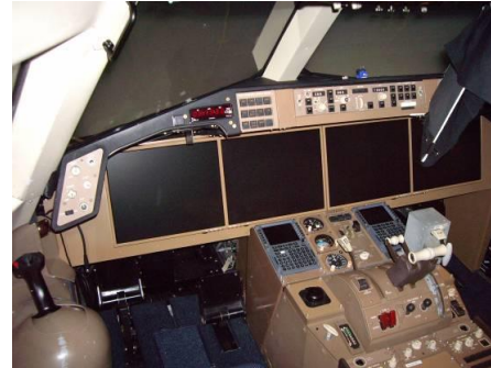
ARD17 Installed in NASA Space Shuttle Simulator

Argon offers a 17" rugged display that is particularly suitable for Command & Control console applications where space is at a premium such as in combat & tactical vehicles, mobile shelters, and close-in naval spaces. The ARD17's small bezel size, flexible mounting configurations, configurable I/O, and universal AC/DC power supply make it a valuable solution for many mission critical applications. Of course, argon will customize the unit to meet your exact electrical or mechanical interfaces.